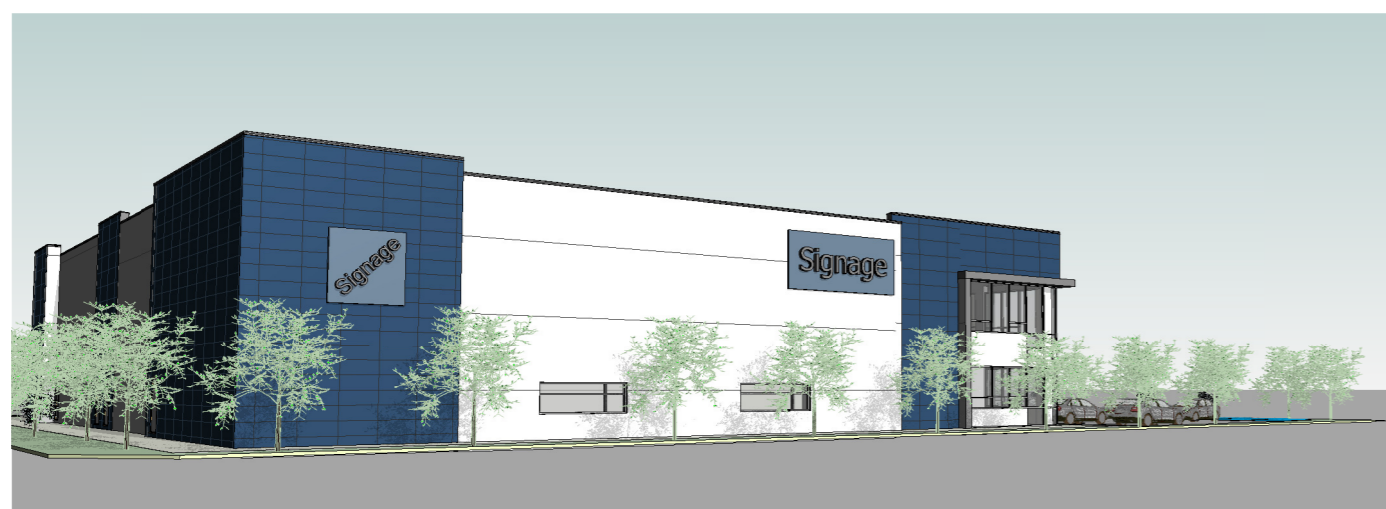
3 Axonometric View - Main Road (Entrance to Site)