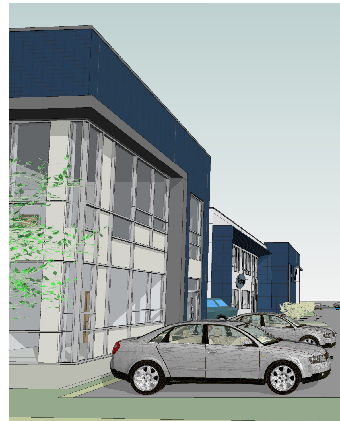
4 Axonometric View - Main Road (Signage facade)