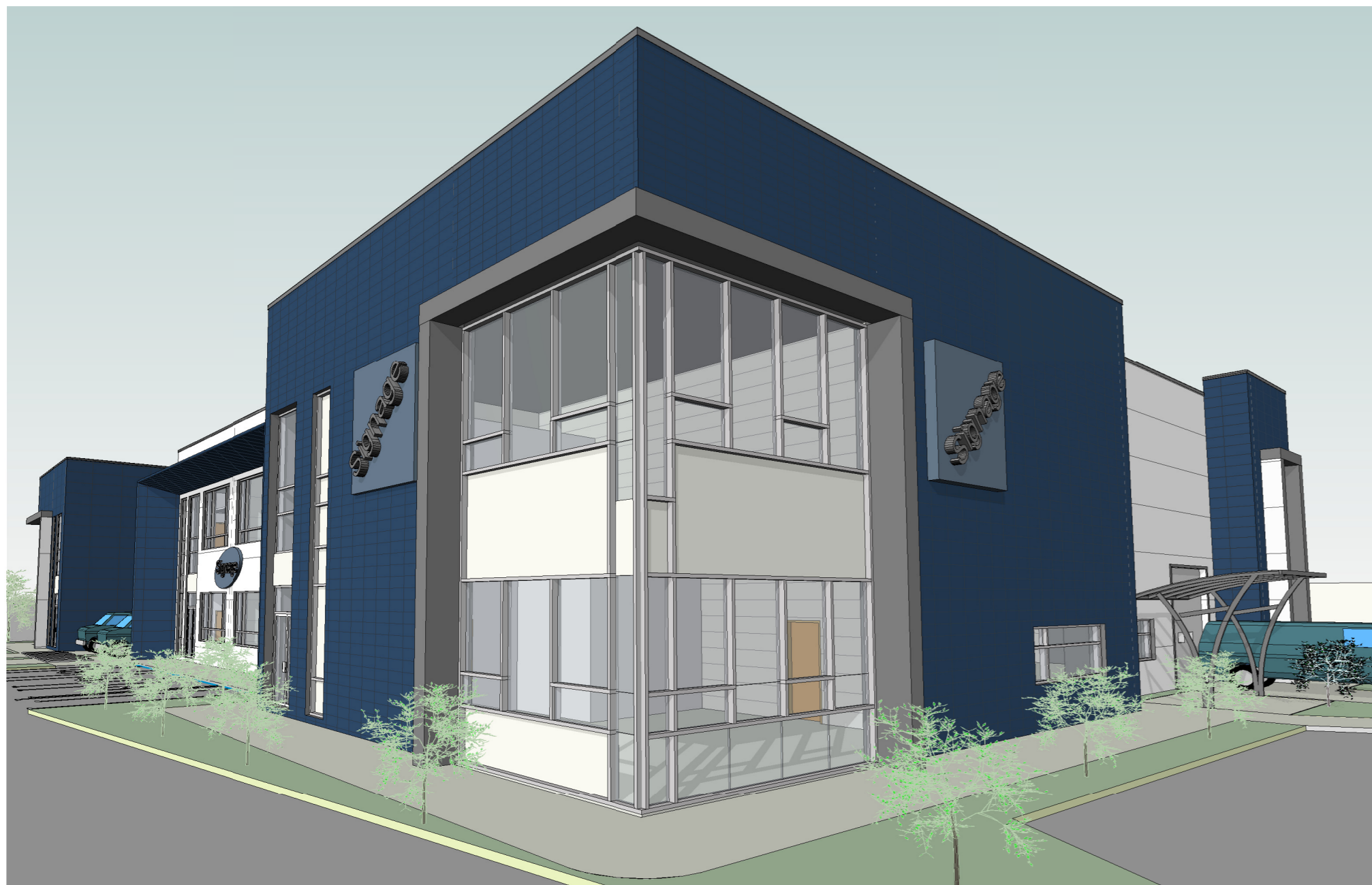
2 Axonometric View - Side of Site