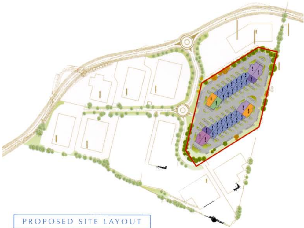
PROPOSED SITE LAYOUT